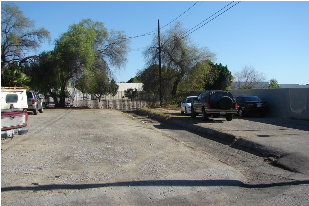
El Dorado Park at El Dorado Avenue (Stormwater Arroyo Opportunity Area)