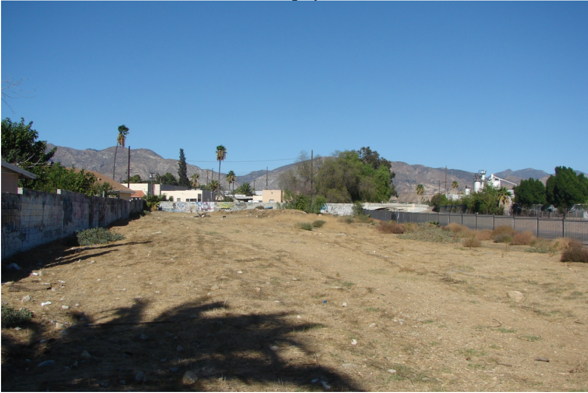
View of Site Looking North