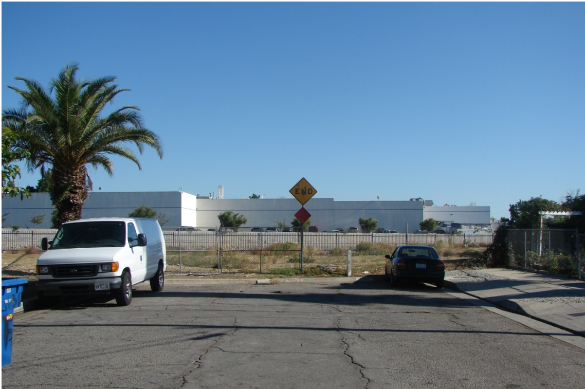
El Dorado Park at Tamarack Avenue