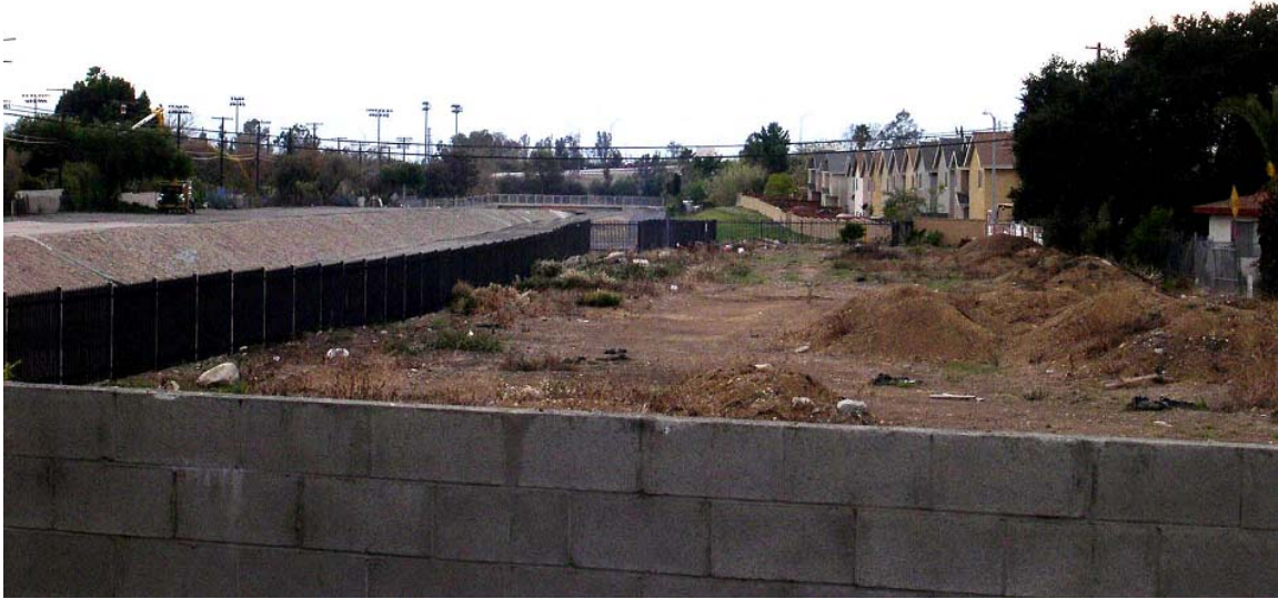
El Dorado Park- View Looking South