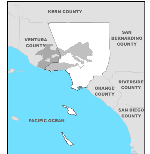
County of Los Angeles